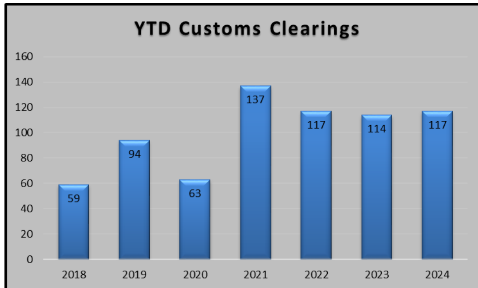
Customs Clearings Year to Date through March 2024