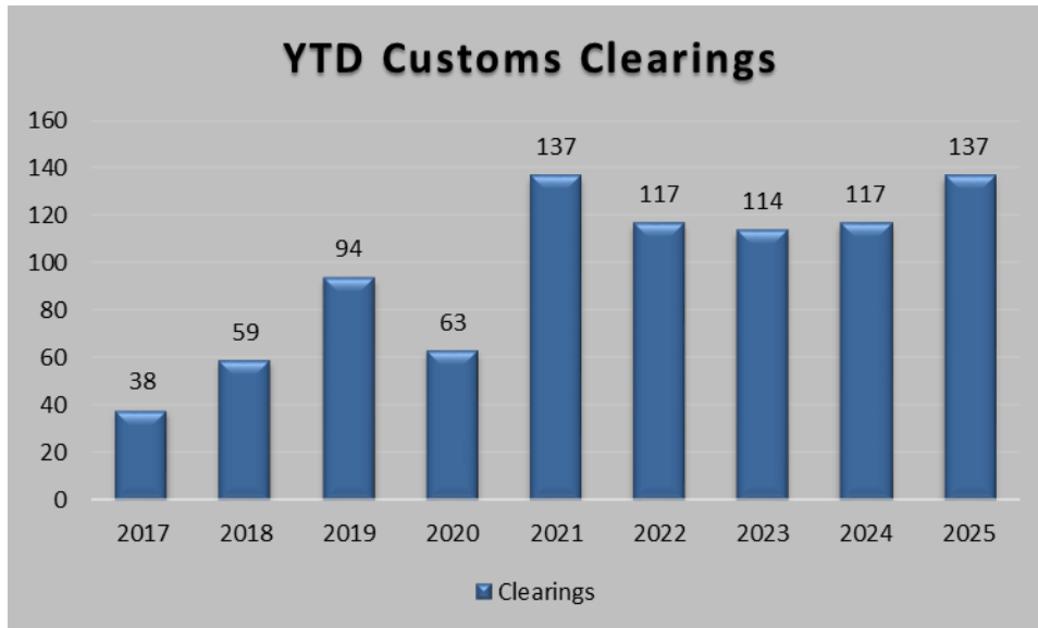
Customs Clearings Year to Date through March 2025