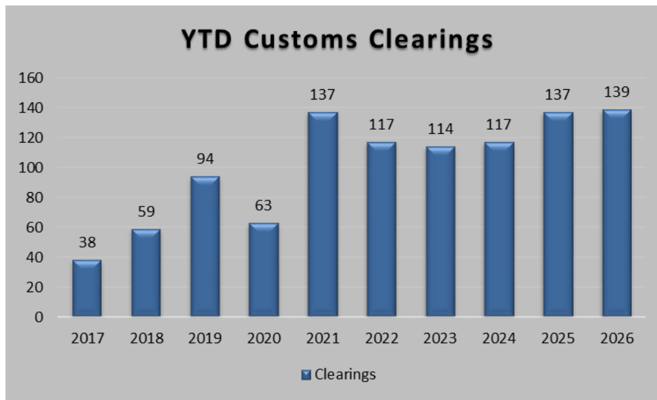
Customs Clearings Year to Date through March 2026