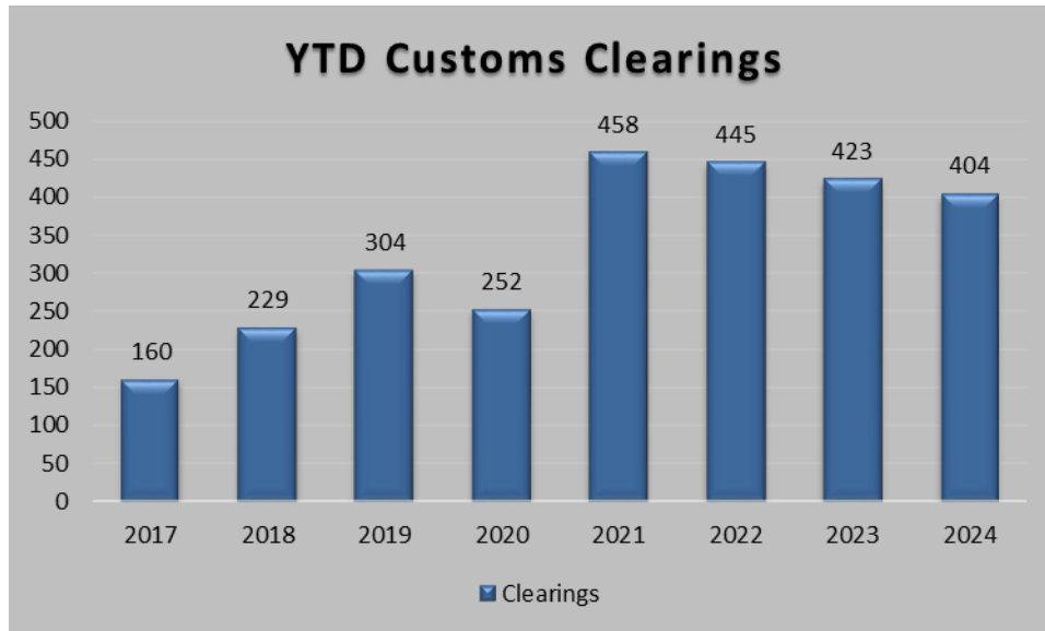
Customs Clearings Year to Date through November 2024