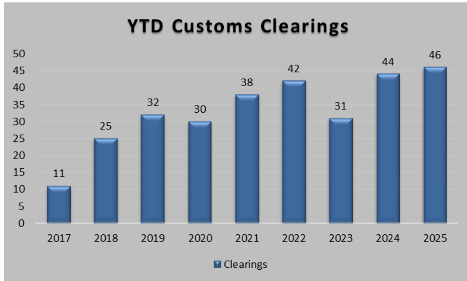
Customs Clearings Year to Date through January 2025