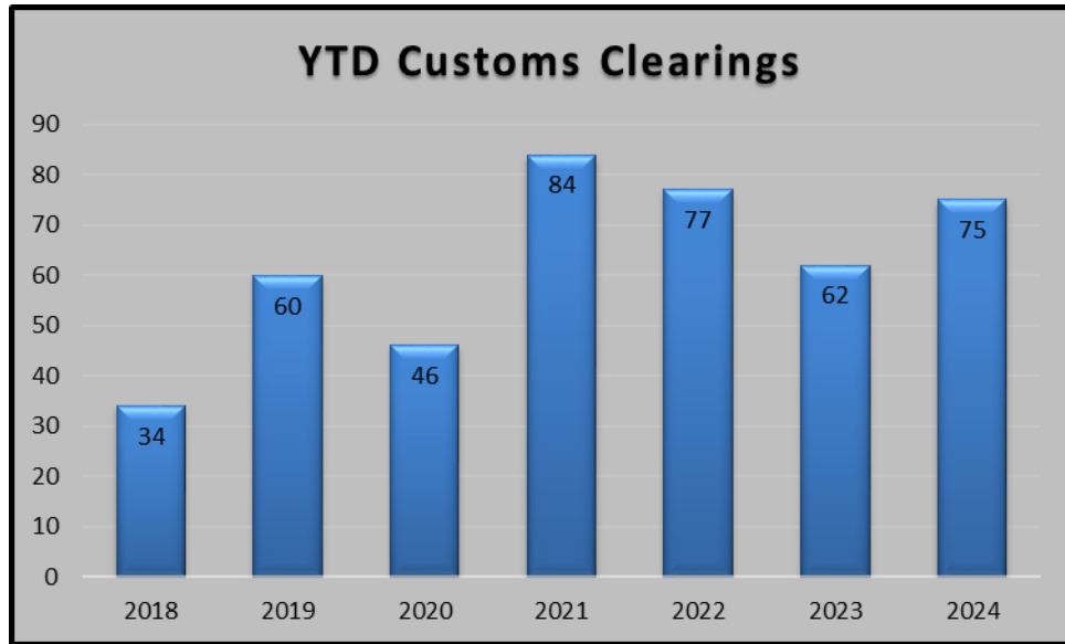
Customs Clearings Year to Date through February 2024