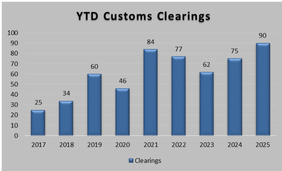
Customs Clearings Year to Date through February 2025