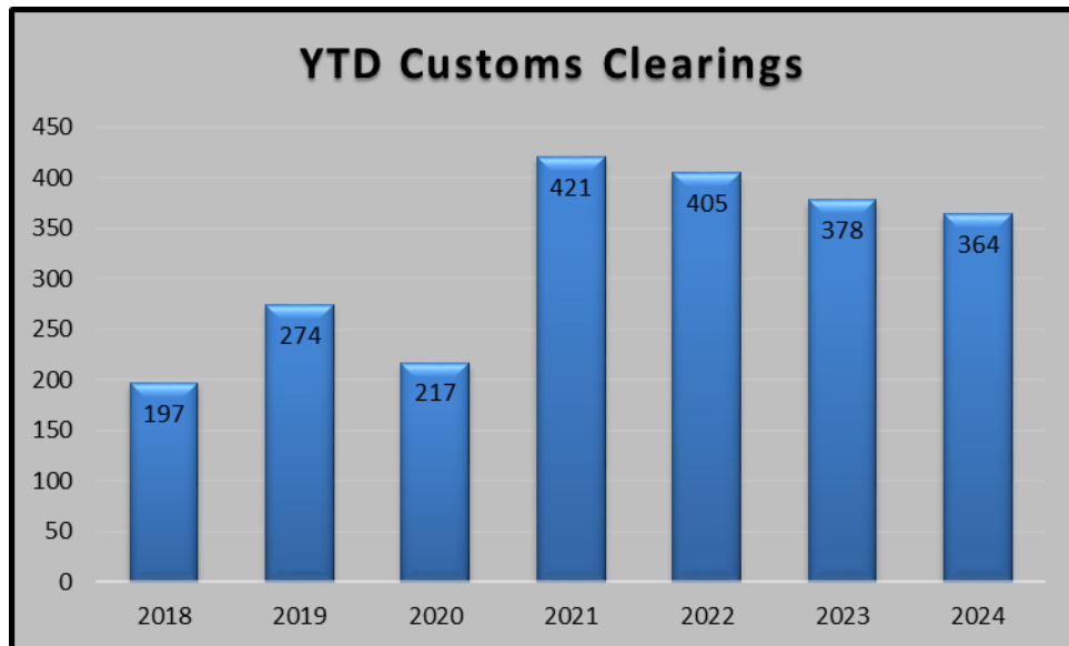
Customs Clearings Year to Date through October 2024