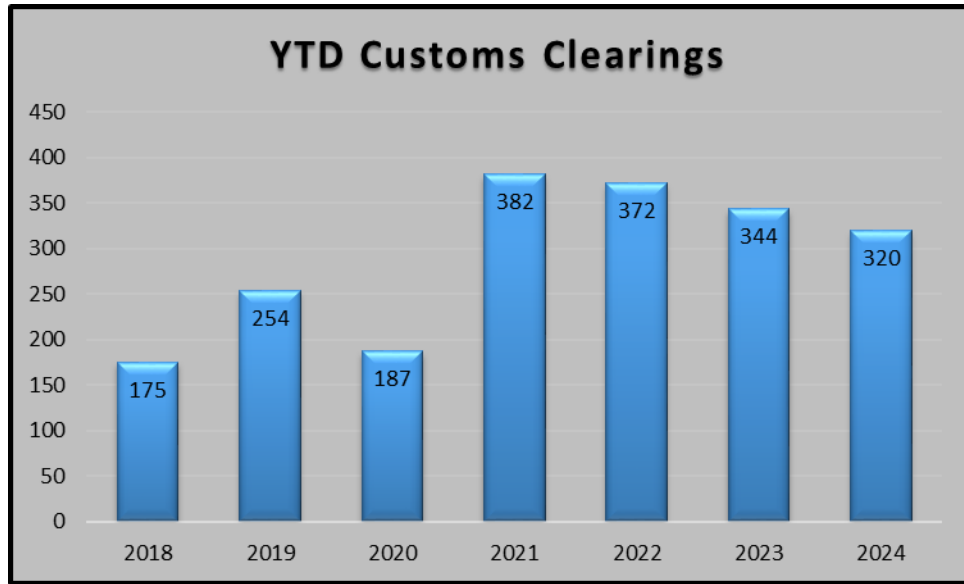
Customs Clearings Year to Date through September 2024