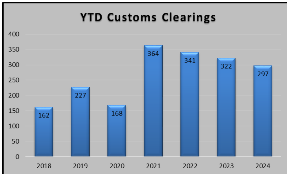
Customs Clearings Year to Date through August 2024